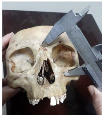
d. Distance between Infraorbital Foramen and Nasion