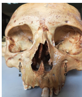
Figure 2: Shape of Infraorbital Foramen [Round (R), Oval (O)]