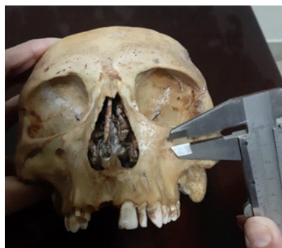
a. Vertical Diameter of IOF