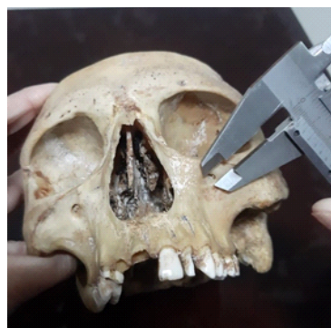
b. Horizontal Diameter of IOF