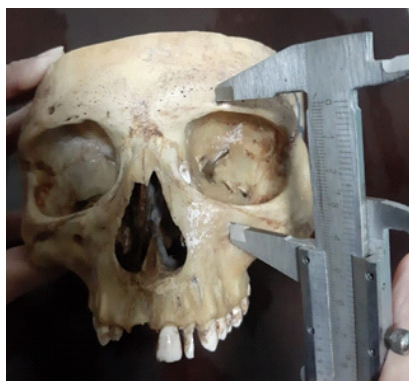
e. Distance between Infraorbital Foramen and Supraorbital Foramen