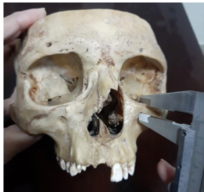
c. Distance between Infraorbital Foramen and Infraorbital Margin