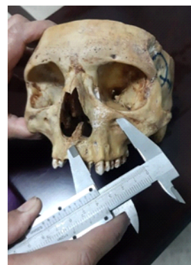
f. Distance between Infraorbital Foramen and Anterior Nasal Spine